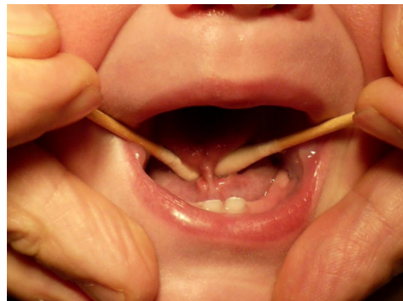
Fig. 1. An example of a two-month-old child with Type III ankyloglossia. Note the thick white non-elastic frenulum accentuated between the cotton tipped applicators that are lifting the tongue.

Characteristics of all treated infants are shown in Table 1. There were 311 infants evaluated for ankyloglossia and 299 (95%) underwent a frenotomy. Twelve infants did not undergo the