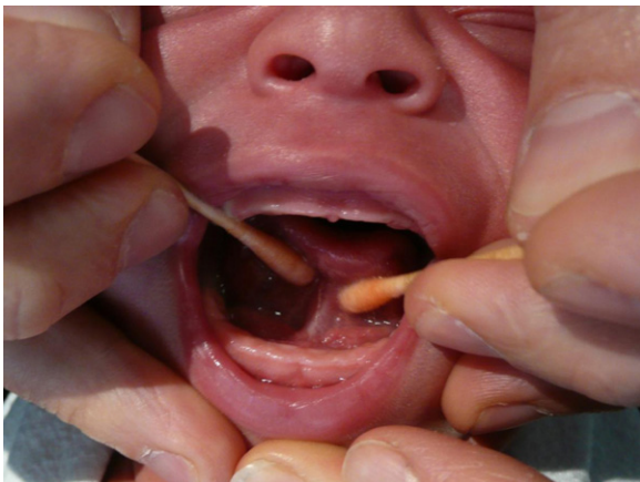
Fig. 2. A one-month-old child with Type IV ankyloglossia. Note the wide midline hump with its white submucosal sheen that is restricting tongue lift between the cotton applicators.

Comparisons between survey respondents and non-respondents are shown in Table 2. A post-treatment survey was completed by 157 mothers for a response rate of 53%. Infants of survey respondents were more likely than non-respondents to have a Type IV ankyloglossia classification (55% vs. 41%) but less likely to have Type III (33% vs. 39%) or anterior (12% vs. 20%) ( P = .021 ). Survey respondents were also more likely than non-respondents to have infants with maxillary tie (44% vs. 29%, P = .024 ). Infant age and gender did not differ significantly by survey response group.